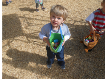
Showing off his egg!

During Bible time we are learning what God's Word says about kindness from one of our memory verses, Ephesians 4:32, "And be ye kind one to another" Our other verse is Proverbs 20:11